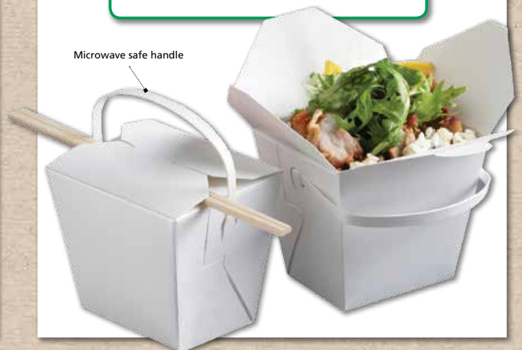
Microwave safe handle