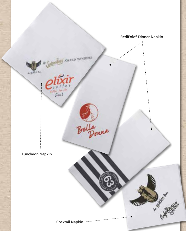
RediFold® Dinner Napkin

Various thicknesses are available from our premium Elegance® napkins through to our standard 1 ply range.