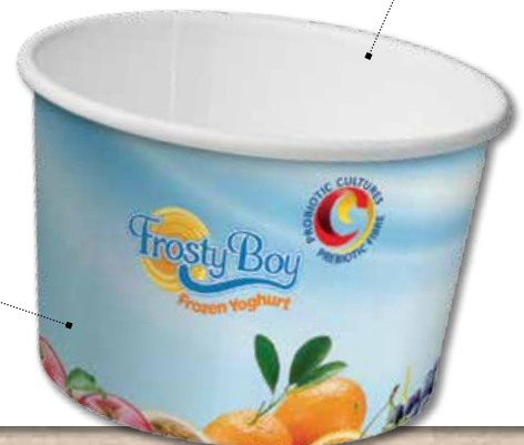
Photo quality printing