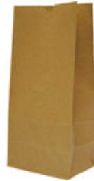
#8 Paper Bag

CA-SOSW-4 White Size: 235 x 125 + 80 mm 500 / carton