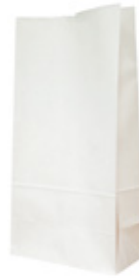
#12 Paper Bag

CA-SOSB-12 Brown Kraft Size: 340 x 178 + 110 mm 250 / carton