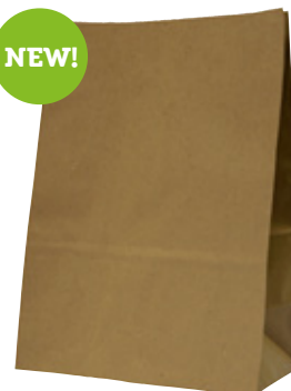
#20 Paper Bag

CA-SOSB-20 Brown Kraft Size: 430 x 305 + 175 mm 250 / carton