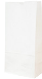
#8 Paper Bag

CA-SOSB-8 Brown Kraft Size: 310 x 152 + 100 mm 500 / carton