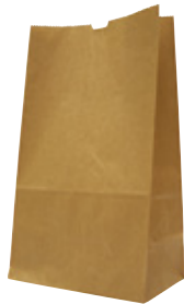
#10 Paper Bag

CA-SOSW-8 White Size: 310 x 152 + 100 mm 500 / carton