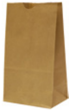
#4 Paper Bag

CA-SOSB-4 Brown Kraft Size: 235 x 125 + 80 mm 500 / carton