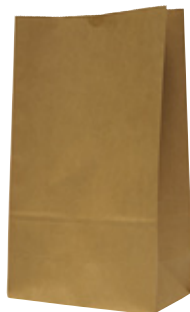
#16 Paper Bag

CA-SOSB-15 Brown Kraft Size: 330 x 257 + 120 mm 250 / carton