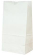
#4 Paper Bag

CA-SOSB-4 Brown Kraft Size: 235 x 125 + 80 mm 500 / carton