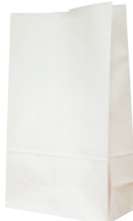
#16 Paper Bag

CA-SOSB-16 Brown Kraft Size: 390 x 240 + 120 mm 250 / carton