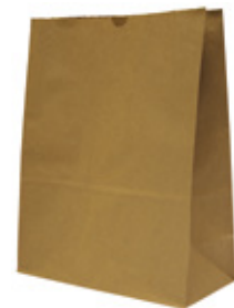
#15 Paper Bag

CA-SOSW-12 White Size: 340 x 178 + 110 mm 250 / carton